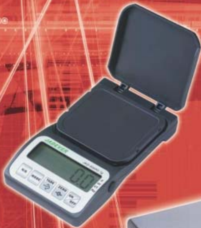
JKD Pocket Scale