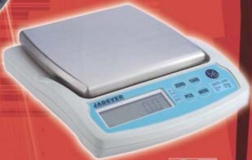
JKH Portable Scale